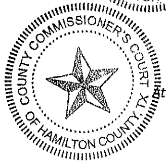
Judge James Yates